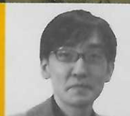
Ichiro Asami Naitai Bridge